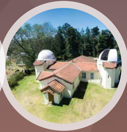
Kodaikanal Solar Observation