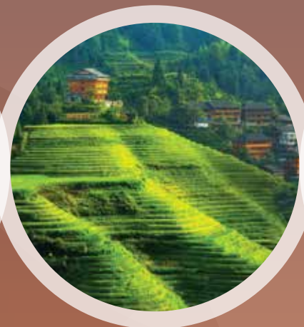
Green Valley Point